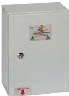
Fully Autonomous wildfire defense systems.