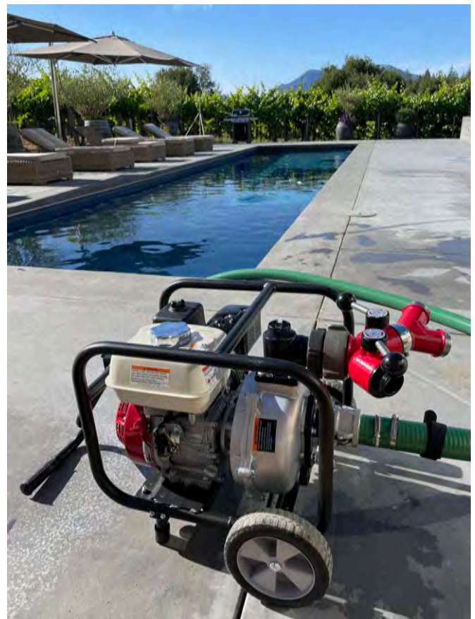
Fire Truck 1.0 in Calistoga, California