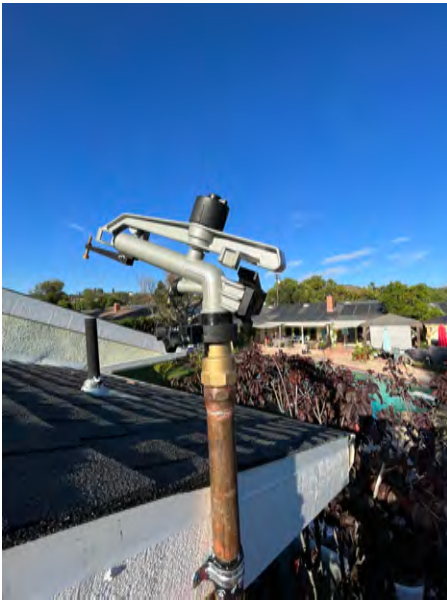
Thousand Oaks - 2 fire sprinklers Long-run gas fire pump

Brushfire designs and installs custom exterior fire defense systems for your home. We offer manually operated, triggered with sensors, or triggered with a text message systems. Portable or mounted to structures, protect your home and property.