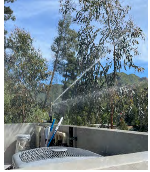
Lake Malibu - 5 fire sprinklers Propane-powered fire pump