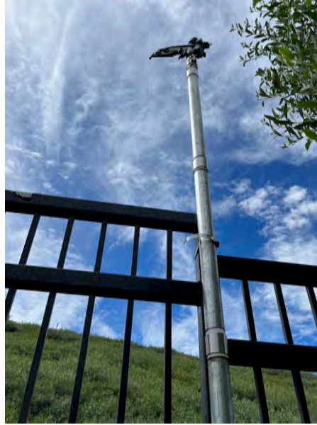
San Juan Capistrano - 2 fire sprinklers - electric remote