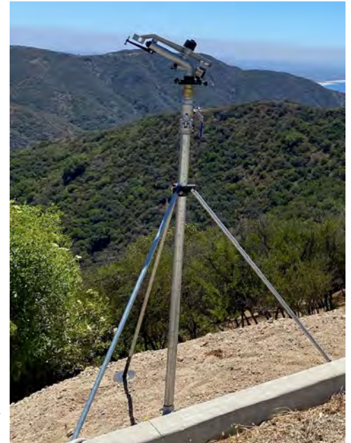
Picture taken at Topanga Canyon installation. Three sprinkler system.