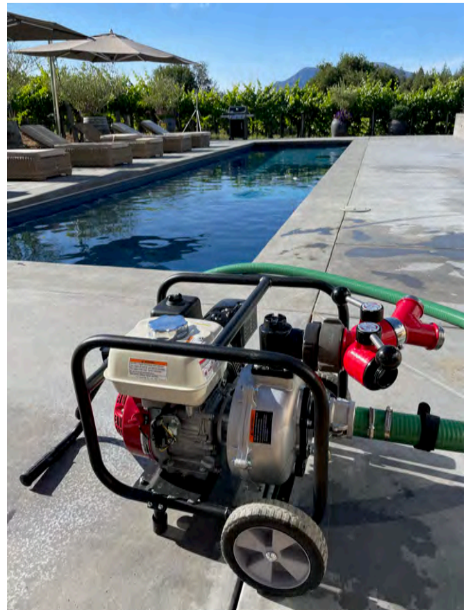
Fire Truck 1.0 in Calistoga, California